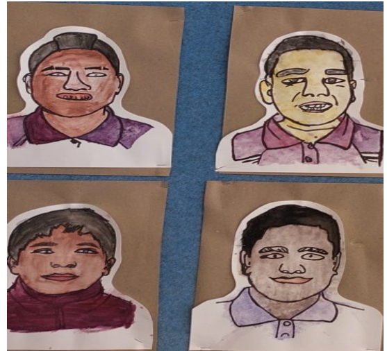
Kahu 2 have been working on some poetry