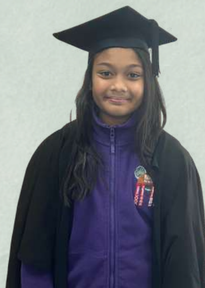
Warrior, Black Ferns player and social worker